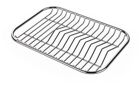
Stainless steel plate rack