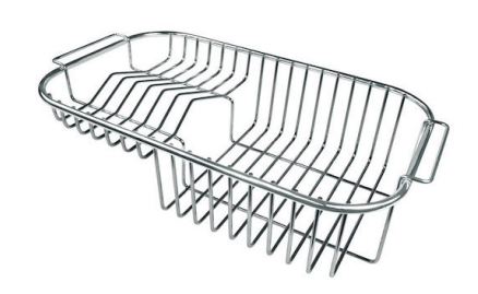
Stainless steel plate rack