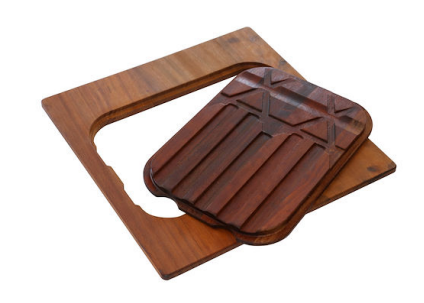
Iroko-wood twin chopping board