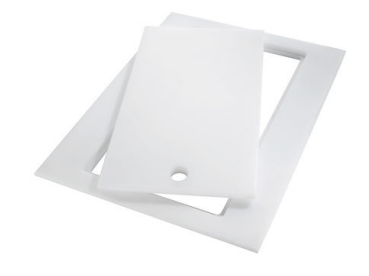
HPDE Twin chopping board