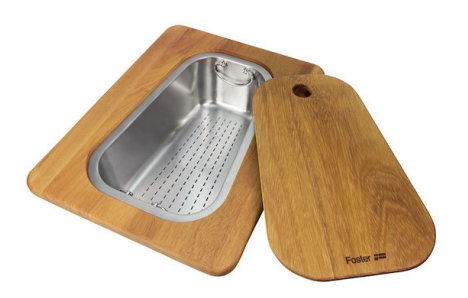
Iroko-wood chopping board with stainless steel colander