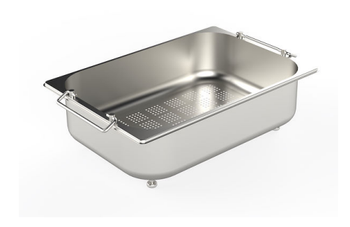
Stainless steel colander